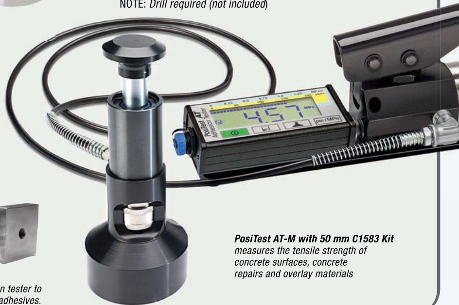
PosiTest AT-M with 50 mm C1583 Kit measures the tensile strength of concrete surfaces, concrete repairs and overlay materials