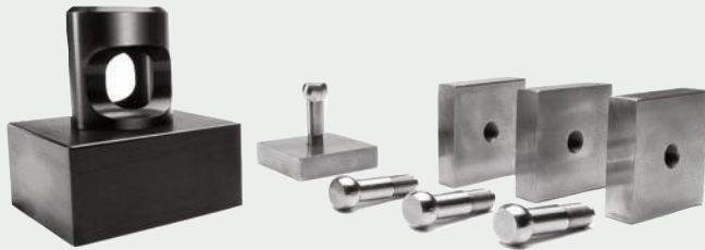
PosiTest AT 50T KIT converts the adhesion tester to measure the tensile strength of ceramic tile adhesives.