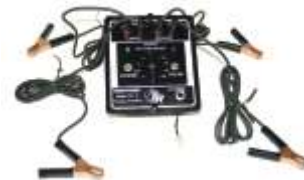
Complete kit with cables