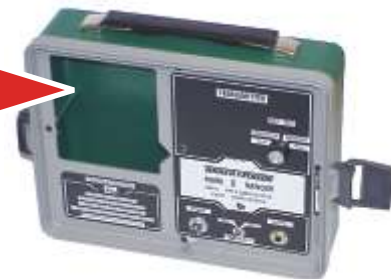
Model Mark V Ranger